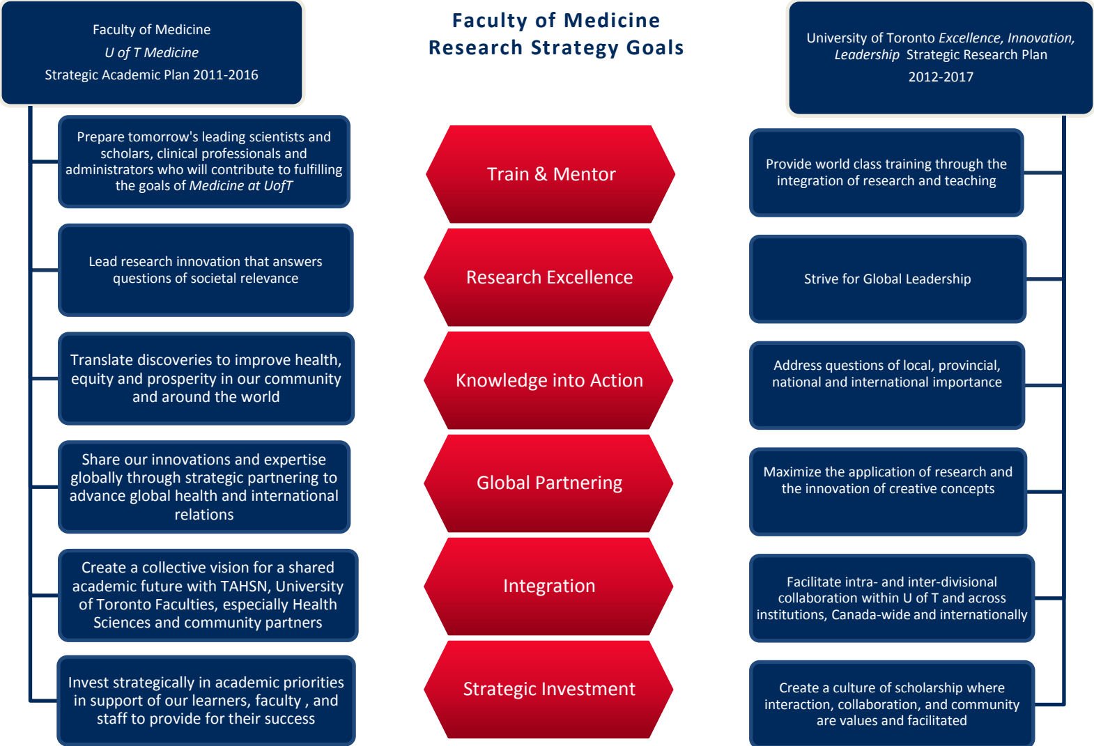
Figure 2: Alignment of the Research Strategic Plan with U of T Medicine’s Strategic plan and the University of Toronto Research Strategic Plan