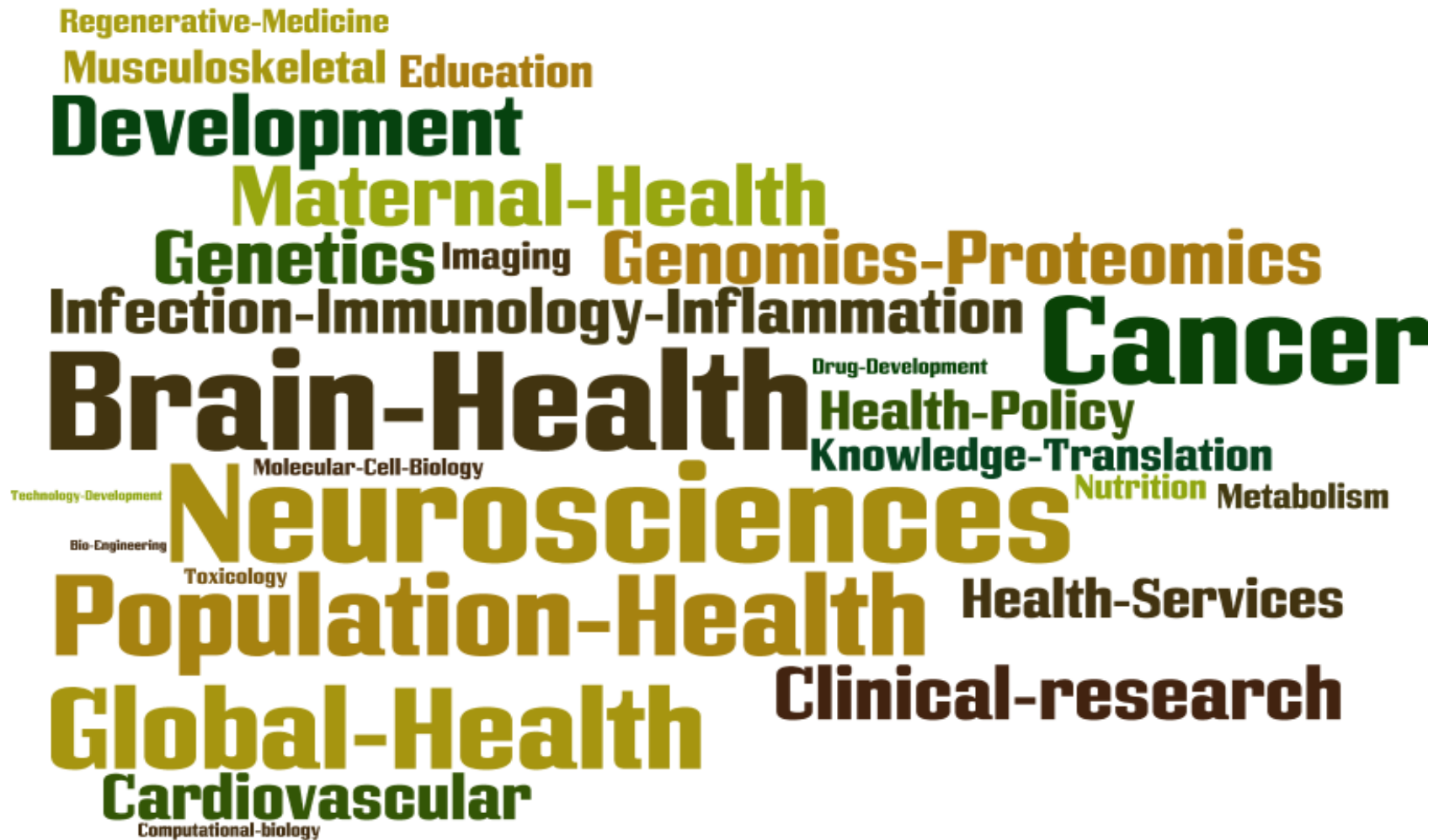
Figure 5: Critical Mass of Researchers/Theme (Size of word reflects number of researchers in topic)